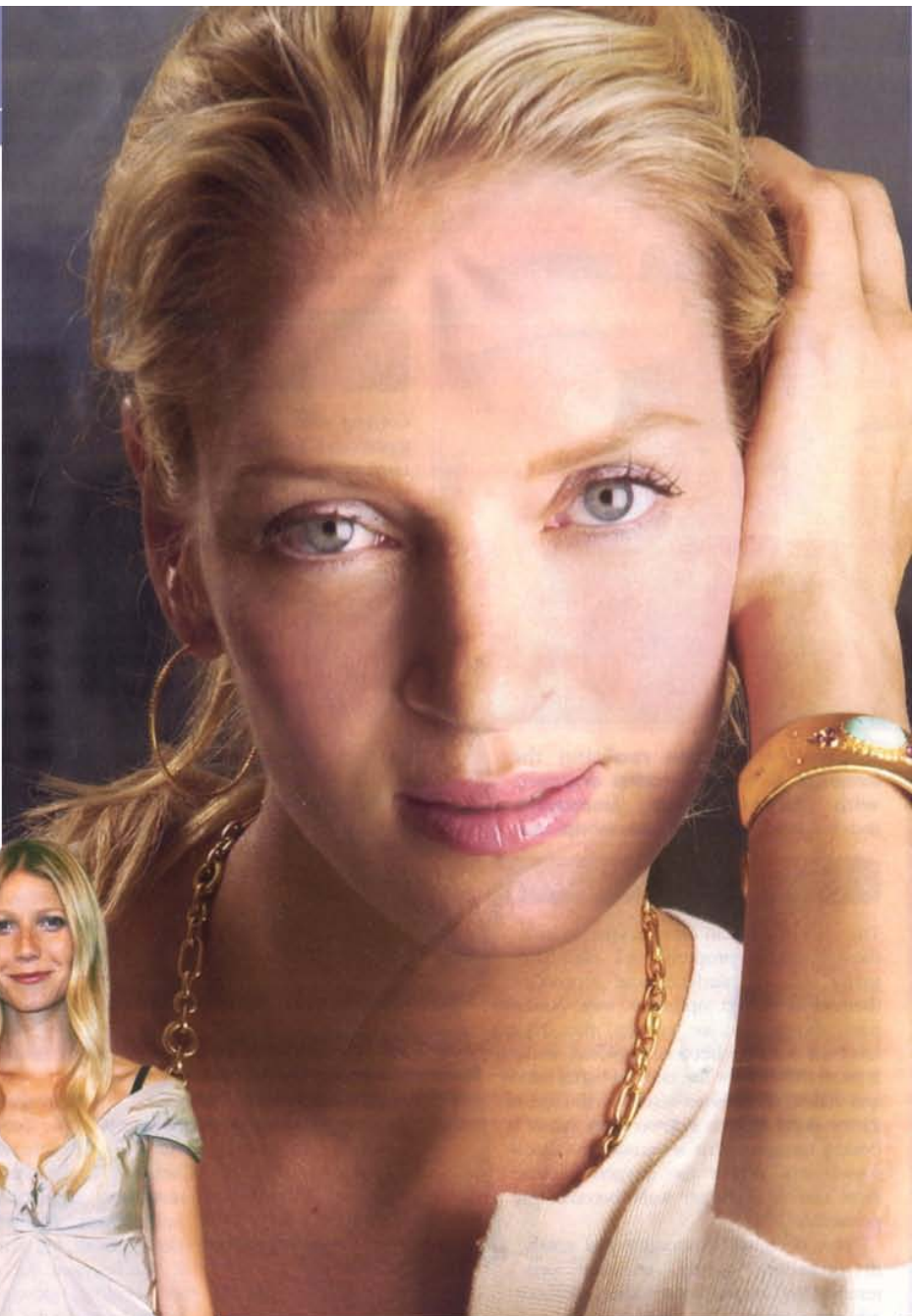
Uma Thurman (above) and Gwyneth Paltrow (left) are just two of the A-list actresses who incorporate oxygen into their health regime. If the skin lacks oxygen it can appear dull and lifeless

Oxygen therapy is well established as a treatment to improve the healing of wounds, burns, skin grafts, soft tissue damage and radiation damage.